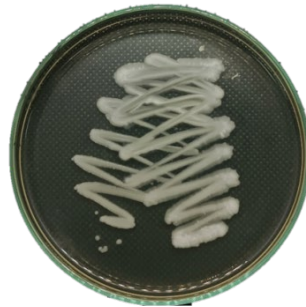
Figure 1. Test of synergistic activity of P. manshurica UNJCC Y-123 and P. cecembensis UNJCC Y-157 by the scratch method

Synergism activity testing was carried out on isolates of P. manshurica UNJCC Y-123 and P. cecembensis UNJCC Y-157 with the scratch method. The yeasts were scratched tangentially aseptically on YMA media so that the scratches between the yeasts met each other. After the inoculation process was carried out, the yeasts were then incubated for 48 h. The results showed that P. manshurica UNJCC Y-123 and P. cecembensis UNJCC Y-157 were compatible, as no inhibition was observed at the intersection of the streaks on YMA medium. This indicates that the two yeast strains can grow in proximity without antagonistic interaction (Figure 1).